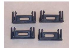
B. Mounting Brackets

Step 1 - Unpack contents of box and find a suitable position for the Play Panel. If you are unsure of where to place it, feel free to call us for advice.