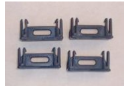
B. Mounting Brackets

Step 1 - Unpack contents of box and find a suitable position for the Play Panel. If you are unsure of where to place it, feel free to call us for advice.